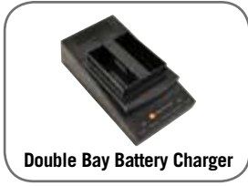
Double Bay Battery Charger