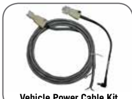
Vehicle Power Cable Kit