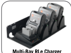
Multi-Bay RLe Charger