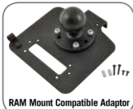
RAM Mount Compatible Adaptor