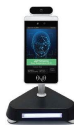
Temperature Scanner Kiosk with Table Stand