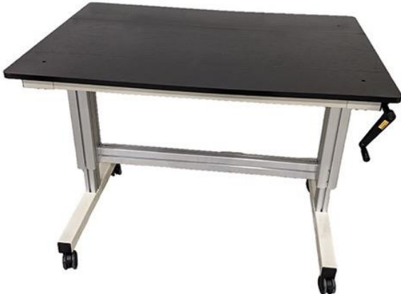
Integrated RFID Table