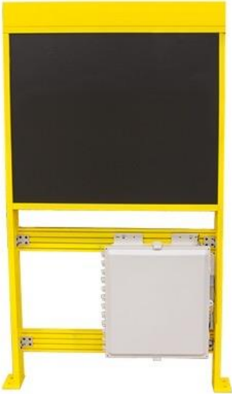
Fixed RFID Tunnel