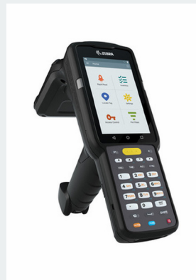
Zebra MC3330xR and MC3390xR