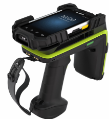
Zebra RFD90 UHF RFID Sled