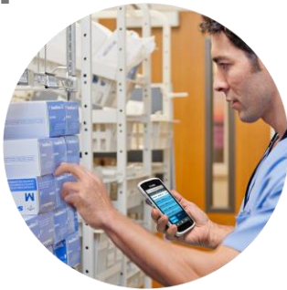
Asset Tracking & Inventory Management