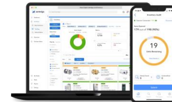
Data Capture Software