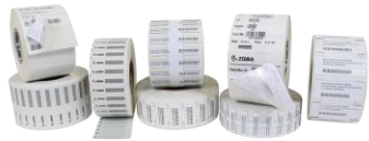
Tags & Labels